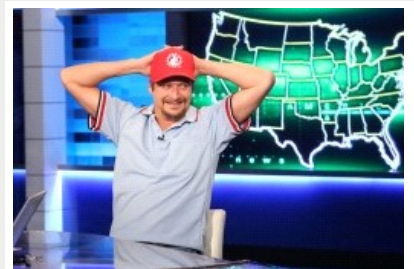
Random Notes: Hottest Rock Pictures