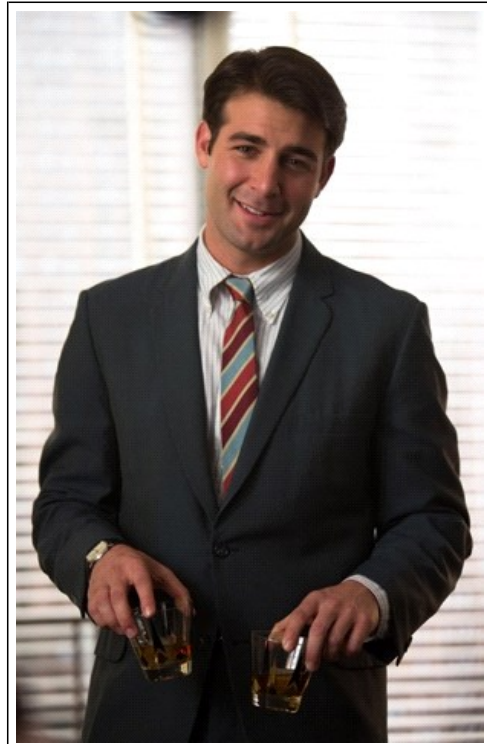
Jimmy Wolk as Bob Benson on 'Mad Men'